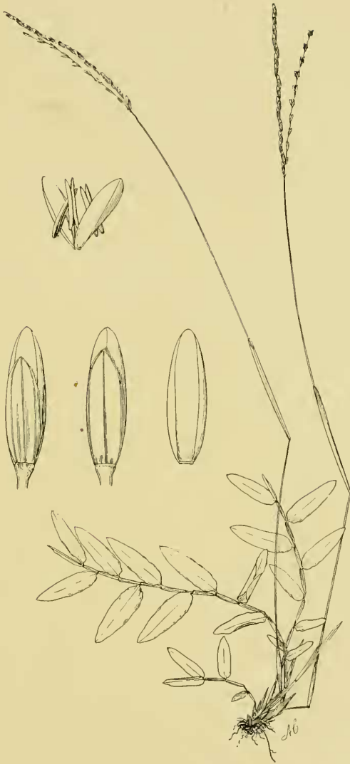
Mniochloa pulchella (Griseb.) Chase.

Plant, natural size. Staminate spikelet, two views of pistillate spikelet and fruit magnified 10 diameters.